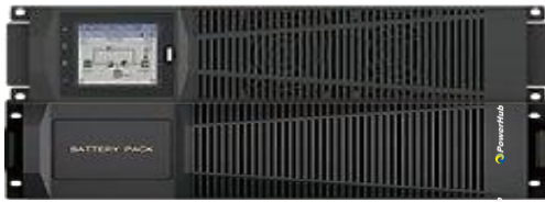
2U UPS + 2U Lithium Battery Pack