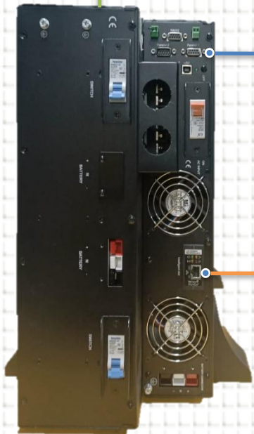
6kVA Elite IV RT with one EBP

N + X Parallel Redundancy The Elite IV RT series supports parallel operation of up to four UPS modules, allowing their outputs to work together in a synchronized manner. Each UPS module is equipped with a built-in parallel controller, which facilitates load sharing and synchronization among the units. This parallel configuration enhances the overall capacity and reliability of the UPS system, ensuring a more robust and dependable power supply for critical applications.