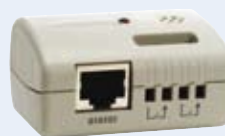
Environmental Monitoring Probe

Independently manage diverse servers. A Multi-Server Card enables up to six serially connected devices of mixed operating systems to be independently managed and controlled by a single UPS.