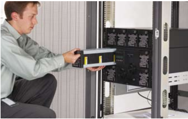
Modular, lightweight design allows for easy installation and service