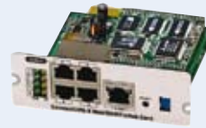
ConnectUPS Web/SNMP Card

The standard unit is equipped with USB and RS-232 serial ports to communicate with power management software. You can customize your UPS by adding an interface card for other applications: