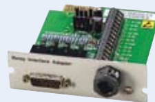
Relay Interface Card

Interwork with you existing Building Management System. A Modbus® Card enables real-time monitoring of UPS systems through a Building Management System or Industrial Automation System.