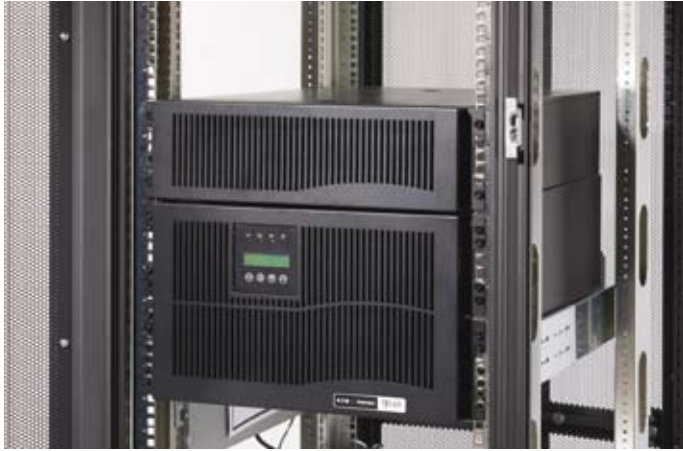
The Powerware 9140 UPS and one EBM occupy only 9U of rack space.